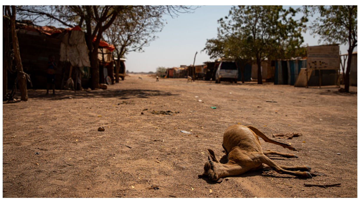
Millions of livestock have died in the Horn of Africa due to drought.

Gellgelo Wele Shake, 54, had 200 cows and around 100 goats and sheep. As a result of the drought, he now has only five goats and two cows. Gellgelo has 10 children but he is unable to support them, and they have now gone to live with other family members. The drought has displaced him from his village in Rhamet Cluster and now he is a refugee in Kelkelloo village of Watchile Woreda. Gellgeo now makes and sells charcoal, however the remote location and lack of market means that his income is very small. He lives on loans and only eats bread once a day.