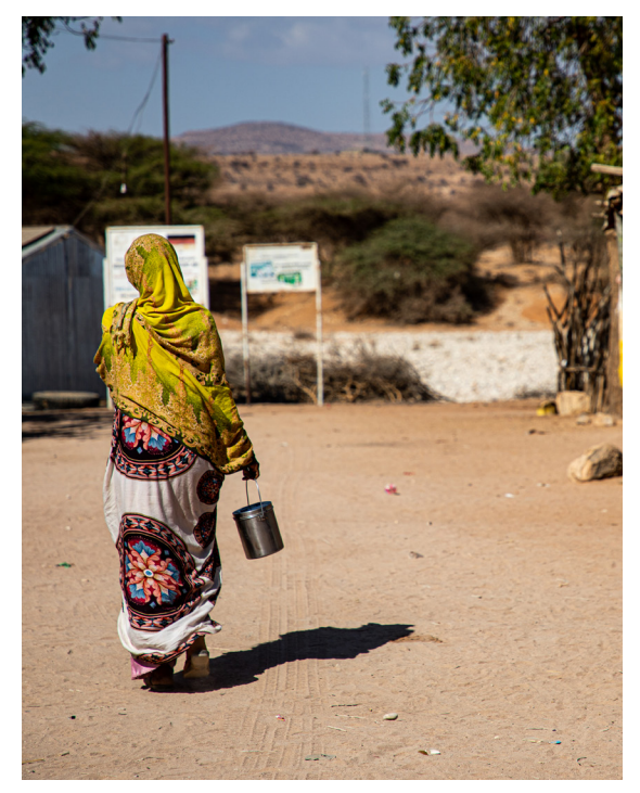
Due to a climate-change-fuelled drought, the last remaining lifeline for the community of Ceel-Dheere, Somaliland, is a shallow well.

ActionAid's emergency teams must now work with local women-led and youth-led partner organisations to provide life-saving food relief and water in the region. More humanitarian support is urgently needed. If you would like to find out more or donate, please click here.