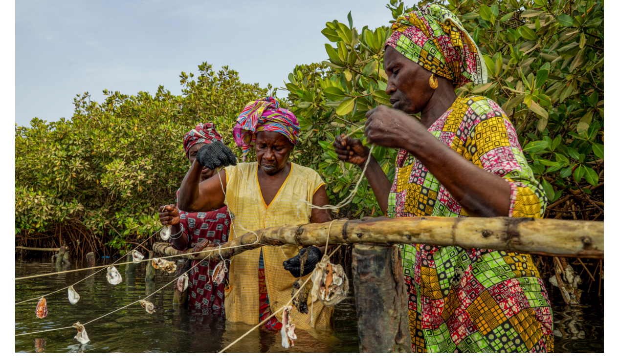
The Saloum Delta islands, Senegal, including the island of Djirnda, are on the frontline of climate change. Here, a local women's group who farm oysters are leading a climate adaption project, focused on growing mangroves to fight the impacts of coastal erosion and climate change.