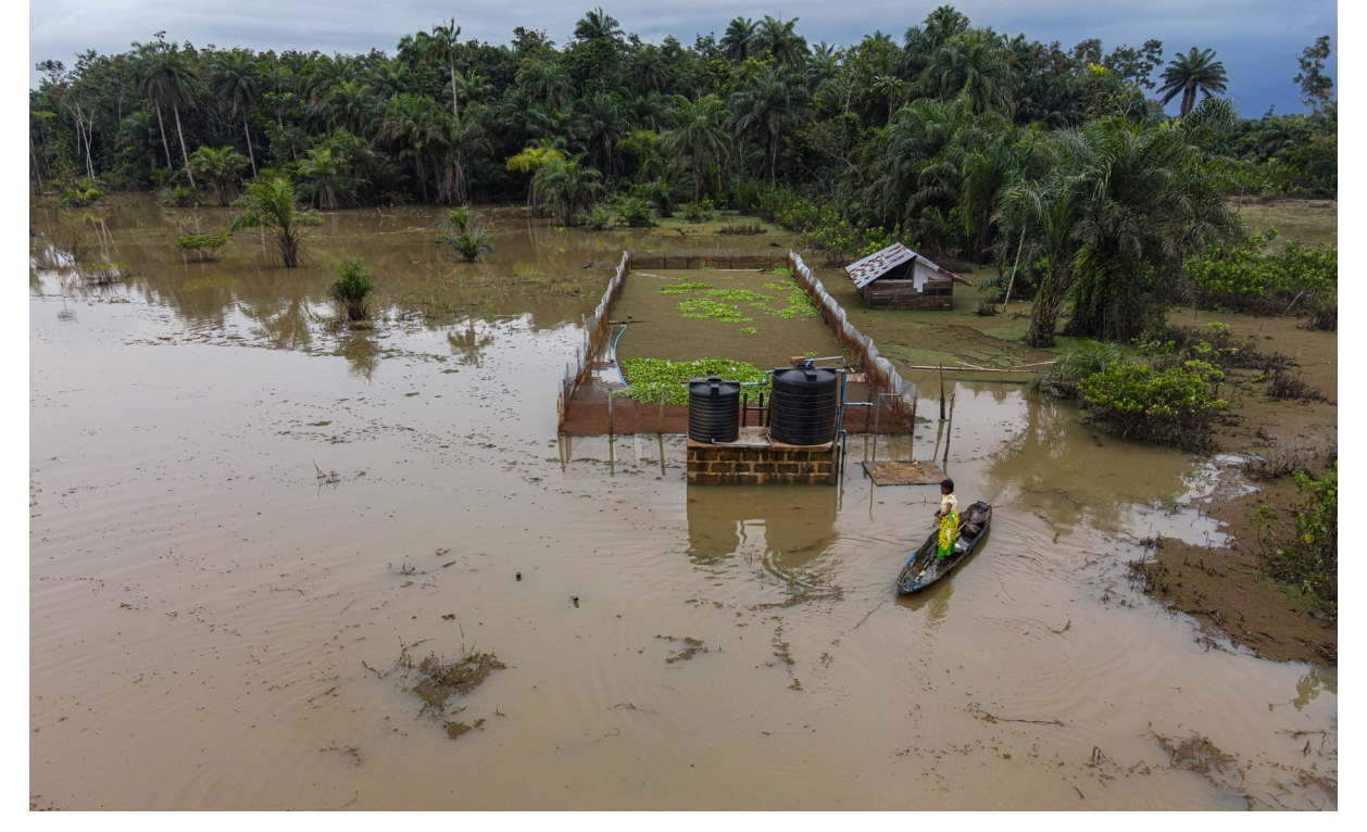
Flooding of the Niger Delta, Nigeria, is one of the direct impacts of climate change on local communities. Around a historic climate case against Shell in the Netherlands, activists spoke out on how the fossil fuel giant has devastated their communities with oil spills, gas flaring, polluted water and human rights abuses.