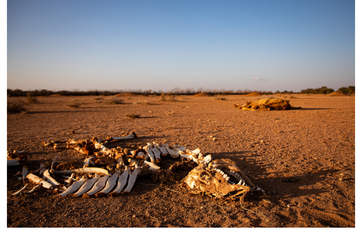
Livestock animals are often first to succumb to drought as farmers focus limited water supplies on their families' survival. The remains of livestock found outside the pastoral community of Ceel-Dheere, Somaliland.